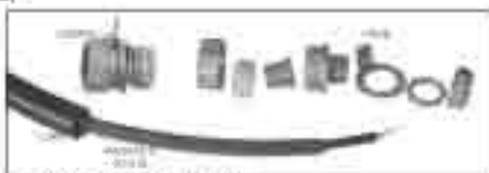
Figure 3 Disassemble LQSR12