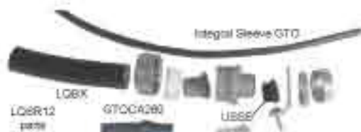
Figure 1 Exploded view of all necessary parts for Electrobits transformer connection when both transformer and sign are in wet locations. Using Integral Sleeve GTO wire. Maximum length of LQSR is 20 feet Cut LQSR 6" shorter than Integral sleeve GTO wire Strip GTO cable on 1" GTO Cable minimum length for proper assembly is 6 inch allowing 1 inch of insulation removed for splices.